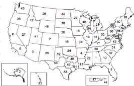
( 1 ) PSWN ( )

2001 6 Low Band VHF(25~50MHz), High Band VHF (138~144/148~174/220~222MHz), UHF(406.1~ 420/450~470/470~512MHz), 800MHz(806~824/ 851~869MHz), 700MHz(764~776/794~806MHz) 가 821~824MHz 866~869MHz 800MHz . PSWN ( 1 )