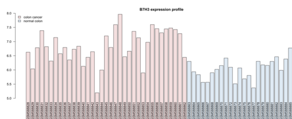
Figure 1. The Gene Expression Profile of B7-H3 Expressed in Colon Carcinoma and Normal Colon Cells. The characters under colon bars are the chip number of GEO

To probe the differentially expressed genes triggered by B7-H3 changes, we applied canonical t-test method to both colon carcinoma and normal cells' gene expression profiles and obtained the differentially expressed genes in colon carcinoma cells. After t-test to all the genes, associated