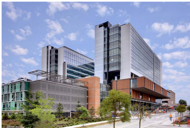
Figure 3. Providence Medical Center, Everett, Washington.

moment frame. With the resulting lighter building, the design team was able to add four stories to the project and shave months off the construction schedule compared to a typical dual system approach.