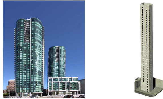
Figure 1. The Infinity, San Francisco, California.

Special Reinforced Concrete Ductile Core Wall – The Infinity, San Francisco, California: This building was the