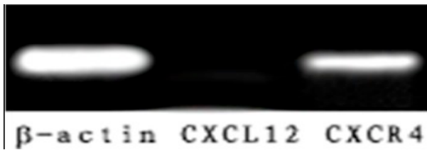
Figure 1. mRNA Expression of CXCL12 and CXCR4 in Pancreatic Cancer Cells. RT-PCR was used to determine semi-quantitative expression of CXCL12 and CXCR4 in Miapaca-2 cells

calculate the number of cells that had passed through the membrane of the chamber.