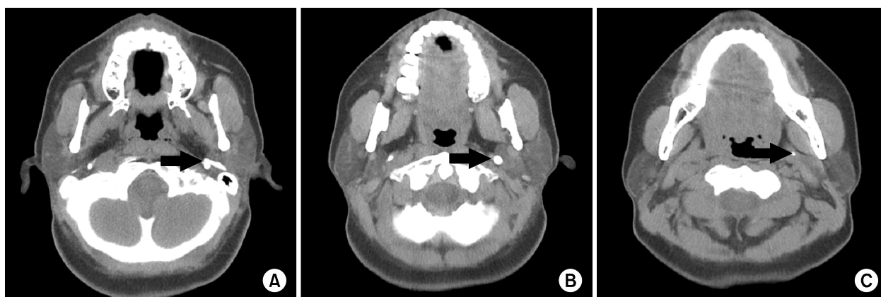
Fig. 2. Axial CT view shows elongated styloid process at left side (black arrows). (A) Origin, (B) Midportion, (C) Distal portion.

Abnormal elongation of the styloid process occurs in approximately 4% of the population; among these, only 4% complain of symptoms. The condition is known to occur