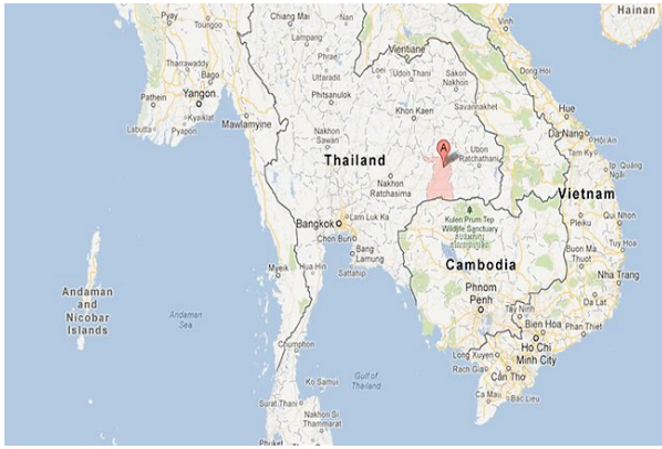
Figure 1. A Google Map Showing the Location of Surin, Thailand