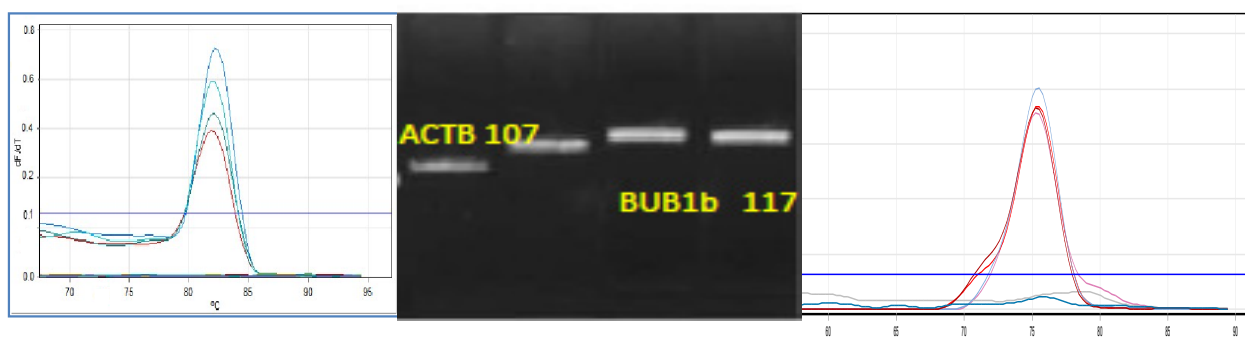
Figure 1 a