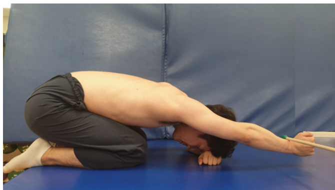
Fig. 2. Arm lifting exercise.