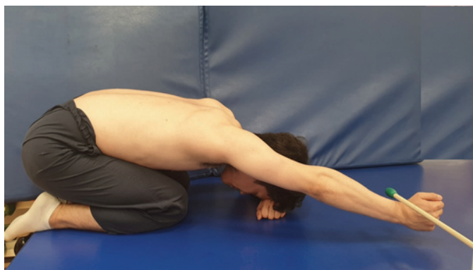
Fig. 4. Diagonal arm lifting exercise.