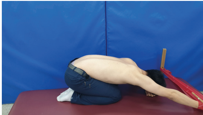
Fig. 5. Diagonal arm lifting with isometric adduction exercise.