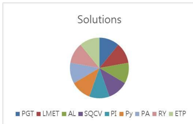
Figure 2: The Structure of Theoretical Findin