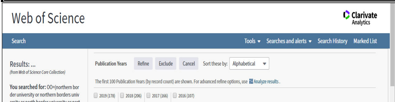
(Figure no. 3)

OO=(northern border university or northern borders university or north border university or north region university or northern region university or northern border university arar or no border university or nbu or no borders university or nbu university)