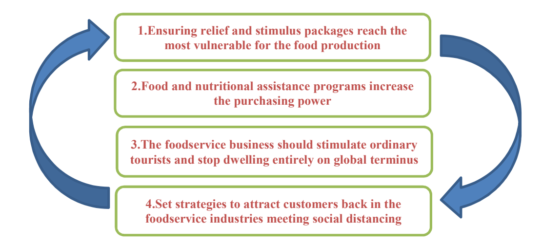
Figure 4: Findings in the Literature Analysis

The hospitality firm that the downturn has hit needs to be better able to interact and reorganize with the foremost and negotiation of the contract. The vendors should be given importance to the digital traveling interventions as the shortest factor in foodservice processing firms. Designing new sources of revenue and implementing numerous canceled regulations are other resolution that helps to curb challenges in food service industries (Pu & Zhong, 2020). Also, the workers need special schemes, healthiness exposure promotion initiatives, and new sanitation products for the Covid-19 pandemic. It is conducted hospitality firms and other industries linked to the transportation schemes as a probable reaction to the outbreak.