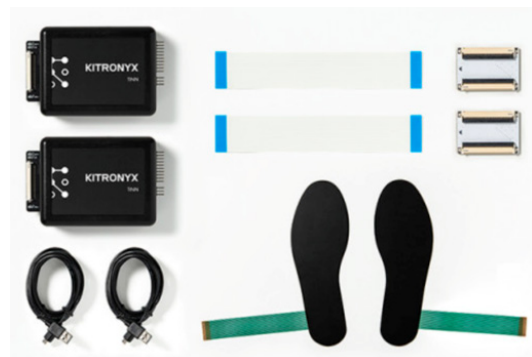
Fig. 2. KITRONYX components to provide real-time visual plantar pressure.

During gait training, a visual plantar pressure feedback information was provided to induce equal weight support on the inner part and outer part of the paralyzed foot during the mid-stance phase of the paralyzed lower extremity. To provide a visual plantar pressure feedback information in real time, MP-2513 (Kytronix, Inc, KOREA), a pressure distribution measurement kit, was used (Fig. 2). A software