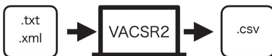
Figure 1. The Process of VACSR 2 Producing Its Output

This section describes how to use VACSR v.2.0 and what it can produce. Users input .txt or .xml files into VACSR v.2.0 for analysis, and it can generate output files in a .csv format (Figure 1).